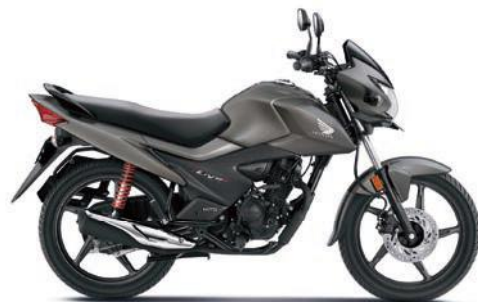
MATT CRUST METALLIC