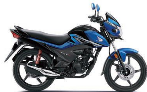
ATHLETIC BLUE METALLIC